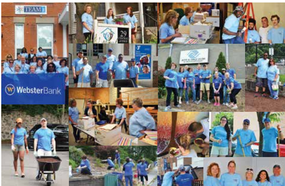
OVER 70 CORPORATE VOLUNTEERS DOING WORK AT PARTNER AGENCIES