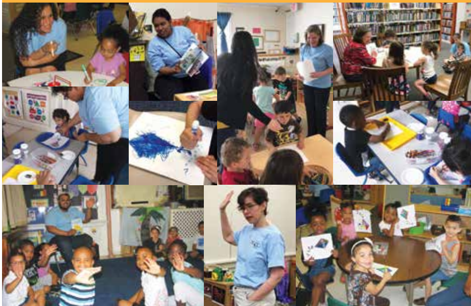
OVER 120 VOLUNTEERS READING TO CHILDREN THROUGHOUT THE AREA